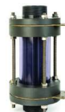
Cell For 100 / 150