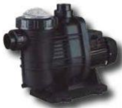
Despiece / Spare parts PAG. 257