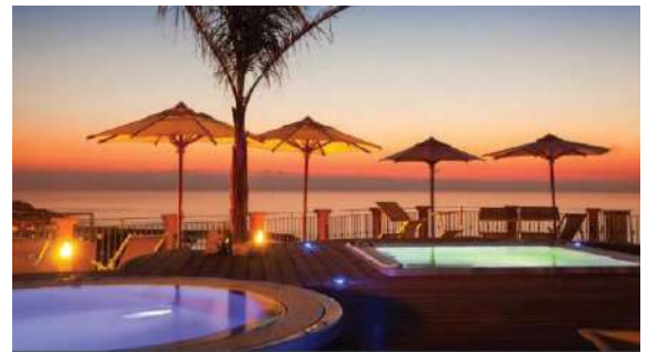
ColorTouch System controls color changes of two pools at the same time