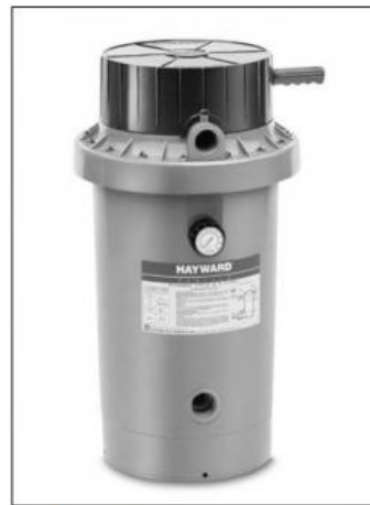
EC75A Basic Perflex Filter

**Based on 2.5 GPM/ft. 2 (maximum allowable NSF rating).