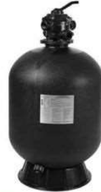
Cristal-Flo II Top-Mount Filters

For residential inground or aboveground swimming pools requiring turnover through 54,000 gallons, at flow rates up to 20 GPM for 8 to 10 hours. Permanent media high rate sand filters in 18 in., 19 in., 22 in., 24 in. and 26 in. diameter models accommodate large and small pools, offering the best combination of economy, performance, durability and ease of maintenance. Corrosion-resistant, one-piece, extra-thick molded polyethylene tank assures long service life. Top-mounted, corrosion-resistant multiport selector valve included. Also includes a convenient tank winterizing drain and continuous air relief system. *Max Operating Temp 95°F